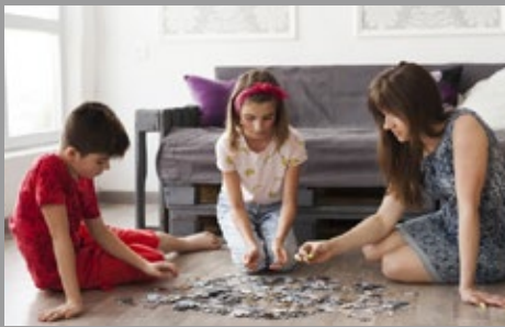
PLAY BOARD GAME